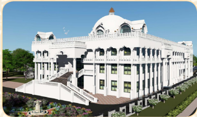
Proposed Dr. B. R Ambedkar Museum & Library, K.U. Dharwad