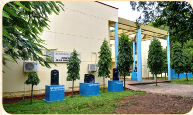
Dr. B. R Ambedkar Studies K.U. Dharwad